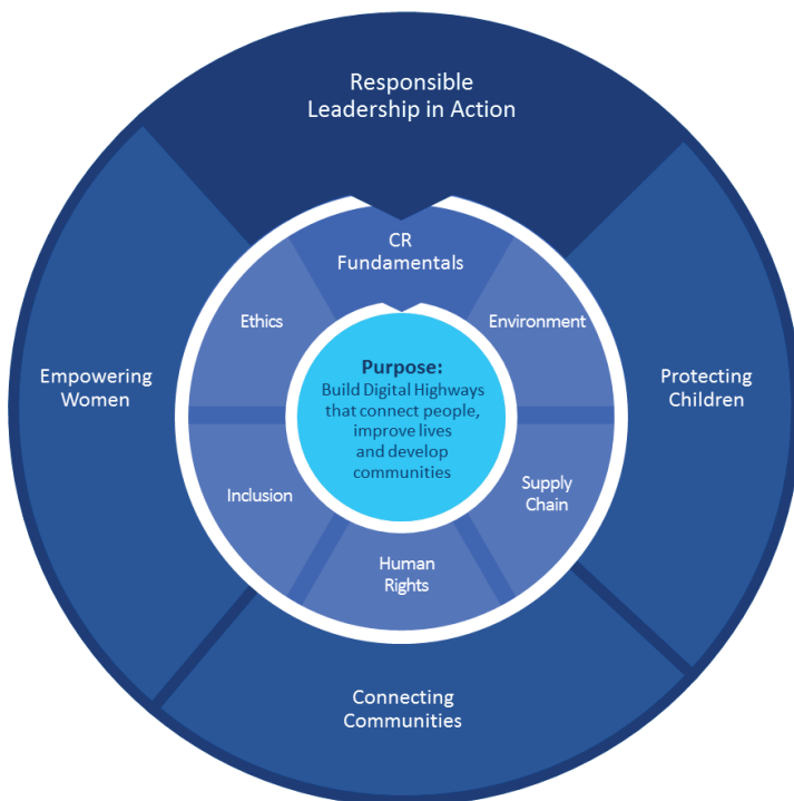
2018 CR Framework